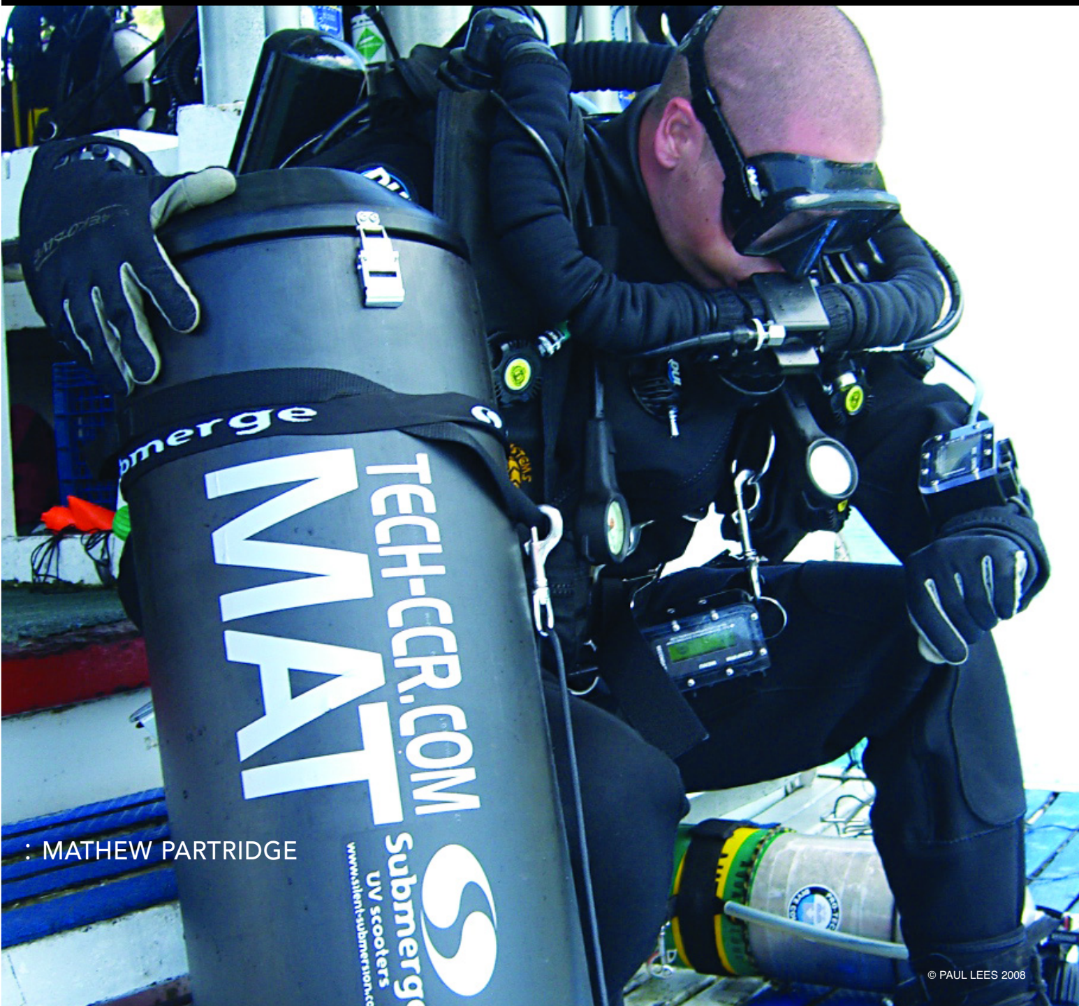
: MATHEW PARTRIDGE